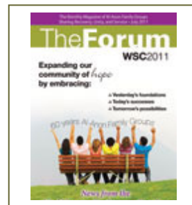
A Meeting in My Pocket